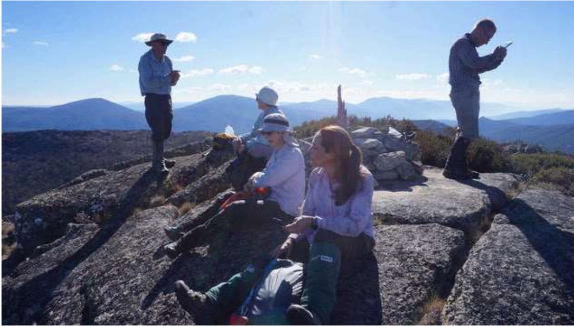
CBC walkers at Mt Kelly last weekend