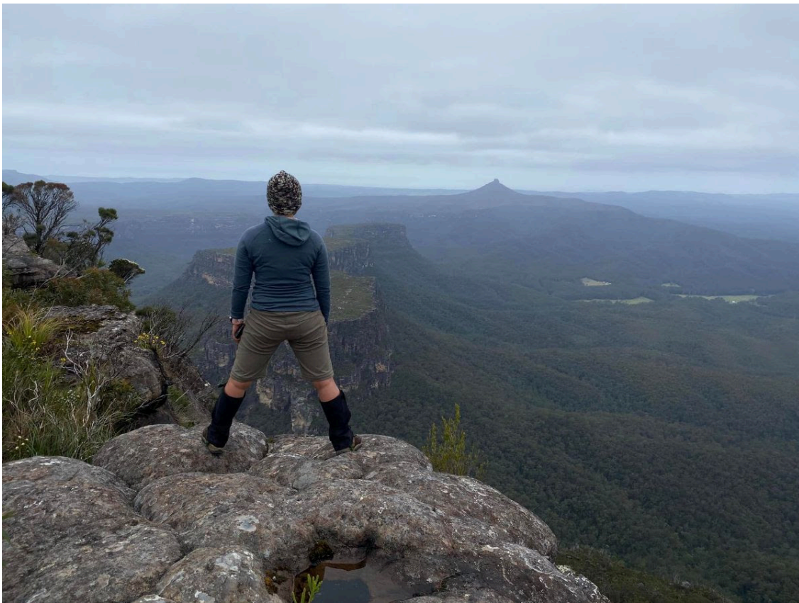
Byangee Walls and Pigeon House from the Castle