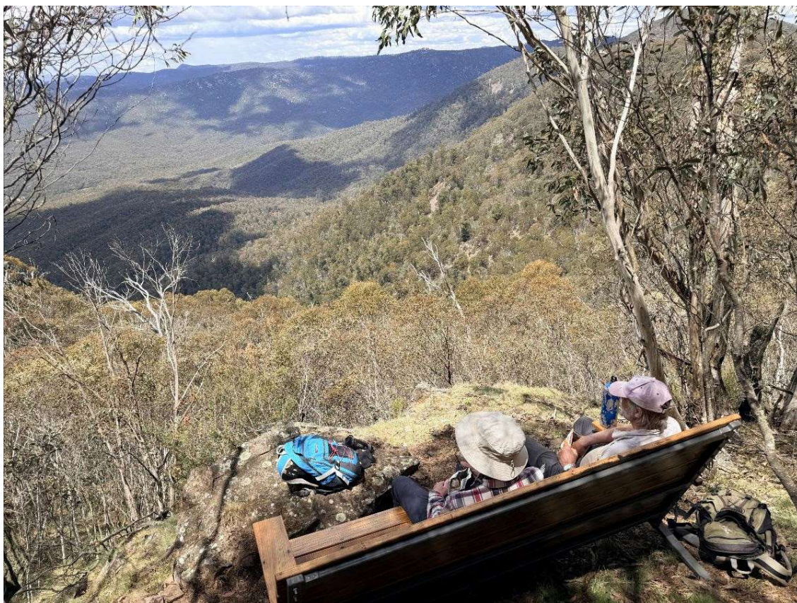
New seat near top of Snowy Corner Track in Mindjagari Track Network at TNR