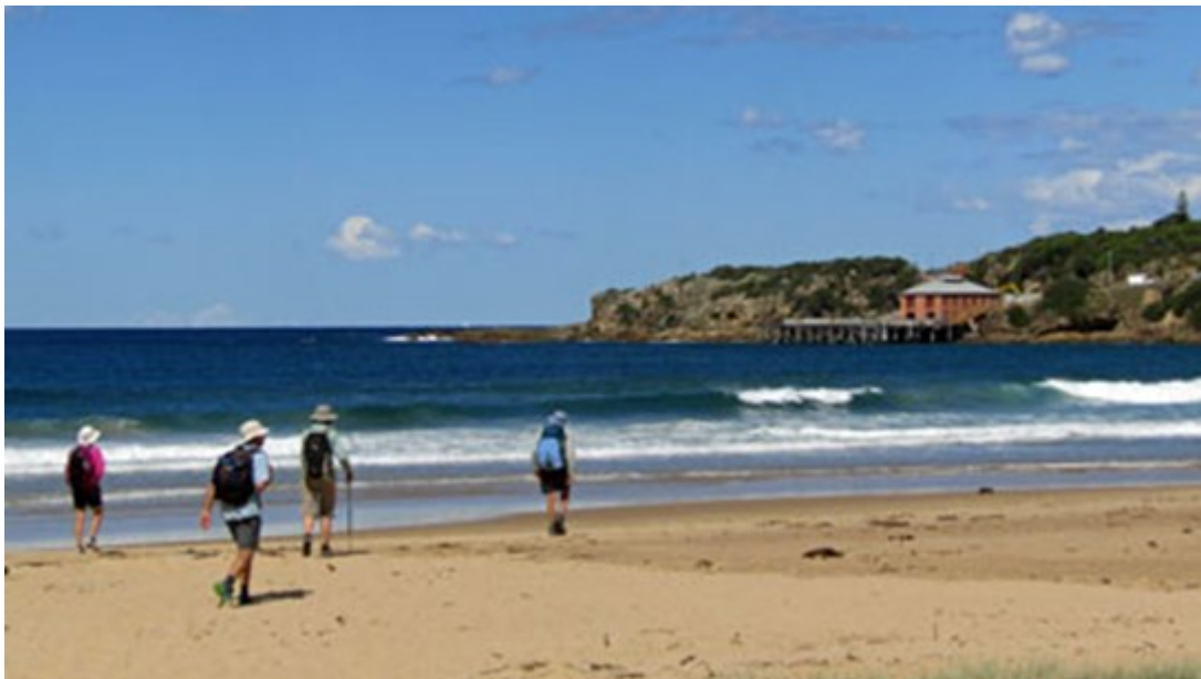
Above: On Ginns Lookout above Picnic Beach.....

the shore of Mogareeka Inlet, which we crossed on the road bridge. A walk along a cycleway and Tathra Beach took us to the Tathra Pub and a welcome celebratory beer to mark the end of Stage 5.