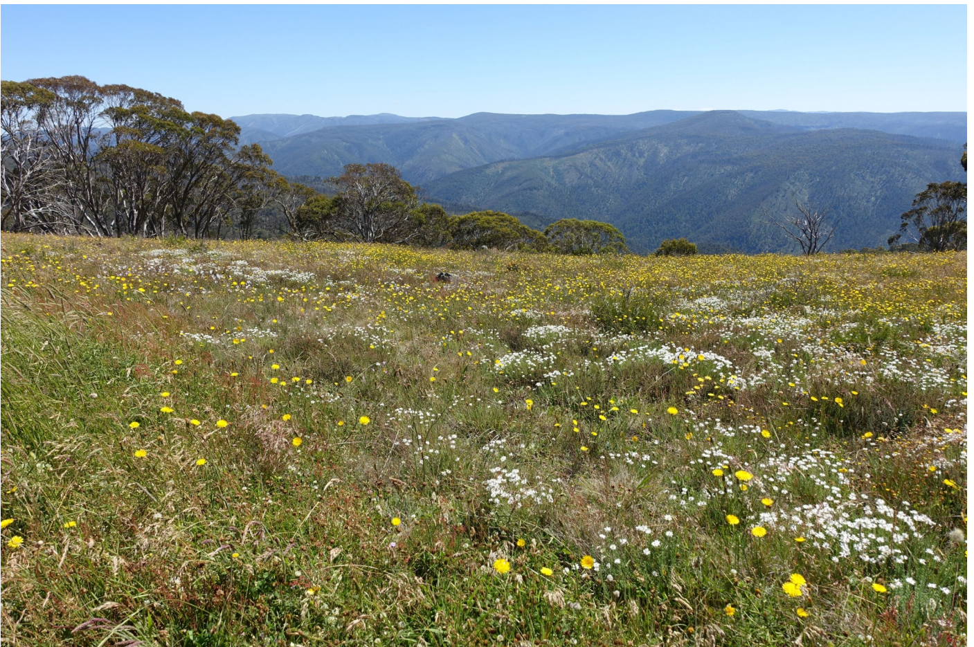
Looking towards Mt Hotham from the King Spur Track

And so it was that a party of eight – six CBC members and two "guests" from Melbourne – commenced the walk on 10 February this year.