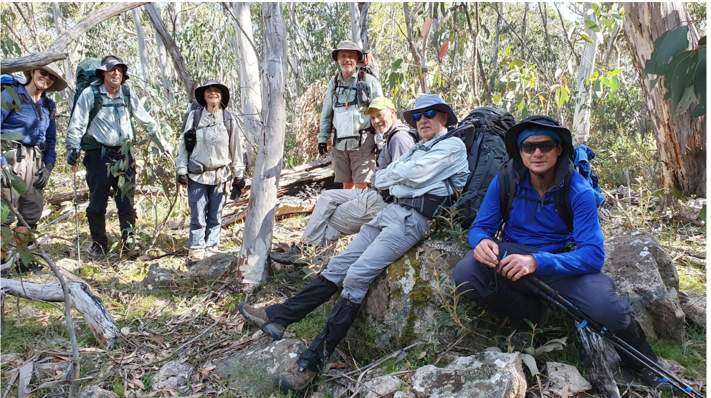
Resting on the ascent to the Moscow Ck Saddle

The first day entailed a long, bumpy drive down the Barry Way and along Limestone Road, then car camping at Native Dog Flat. Next day, after a short drive to the trail head, we walked a couple of kilometres along Cowombat Fire Trail, before leaving the trail to bush-bash our way up to Moscow Creek saddle. We set up camp in the saddle and had an early lunch, then continued with day packs to ascend Mount Cobberas No.1, Middle Peak and Cleft Peak, all requiring some degree of scrambling to reach the highest point. The terrain was challenging, but the mature, unburnt forest was a pleasure to traverse. We returned to our tents at Moscow Creek saddle, happily exhausted, ready for a lovely evening huddled around a small but very cosy camp fire.