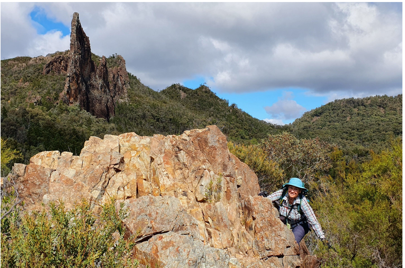
Backed by The Breadknife, Meg reaches the top of Balor Peak, an offshoot of the Grand High Tops Track in the Warrumbungles.