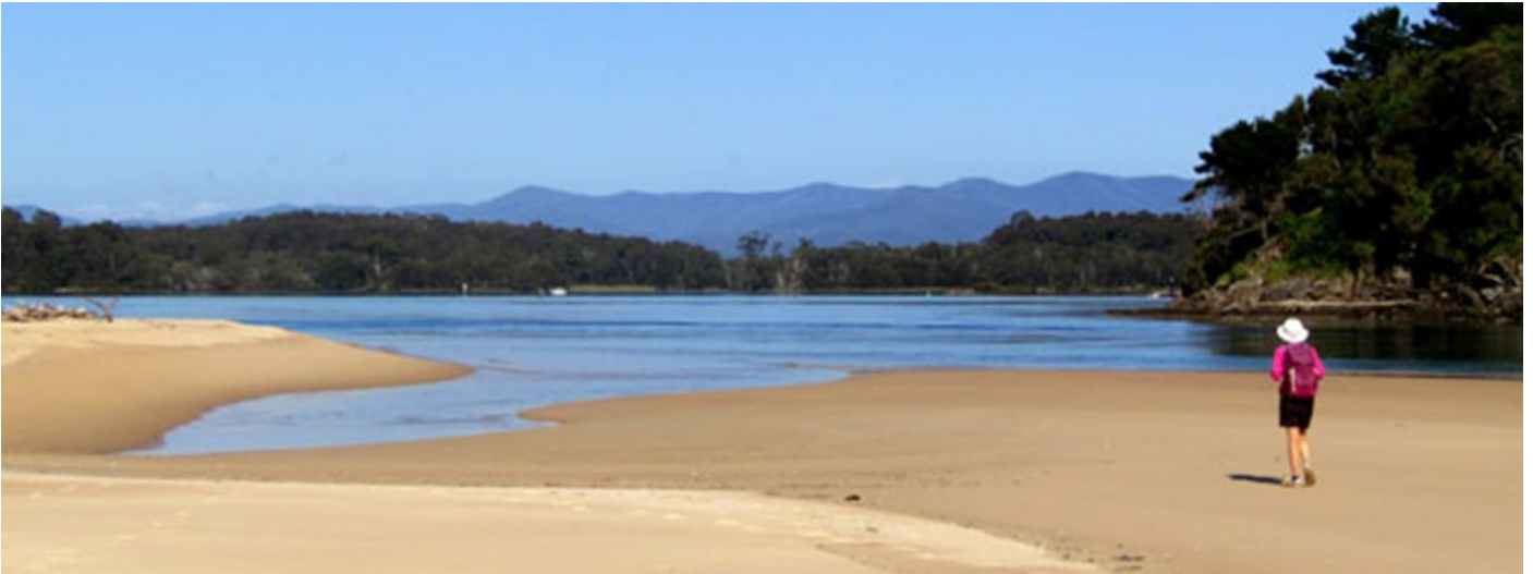
Tuross Lake, from its southern sandspit