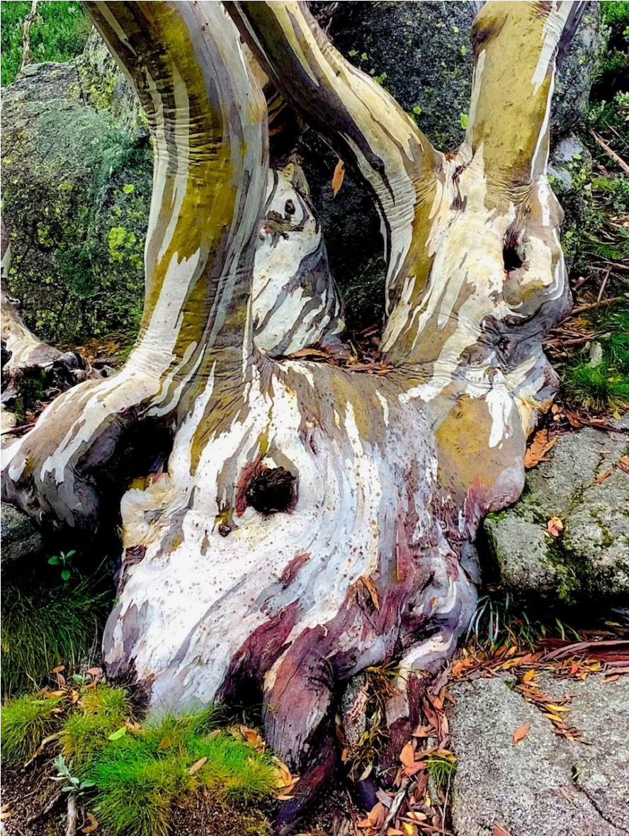
A gnarled old snow gum