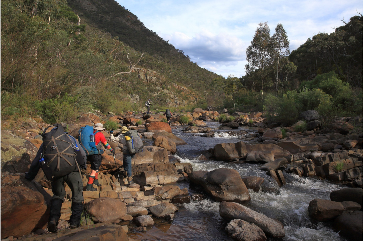
Rockhopping along the Moroka River

the latter part of the walk. Sadly, blackberries and other weed species were also part of our walking experience. One highlight was walking along – and through – the Moroka River in the Mt Darling-Snowy Bluff Wilderness Zone.