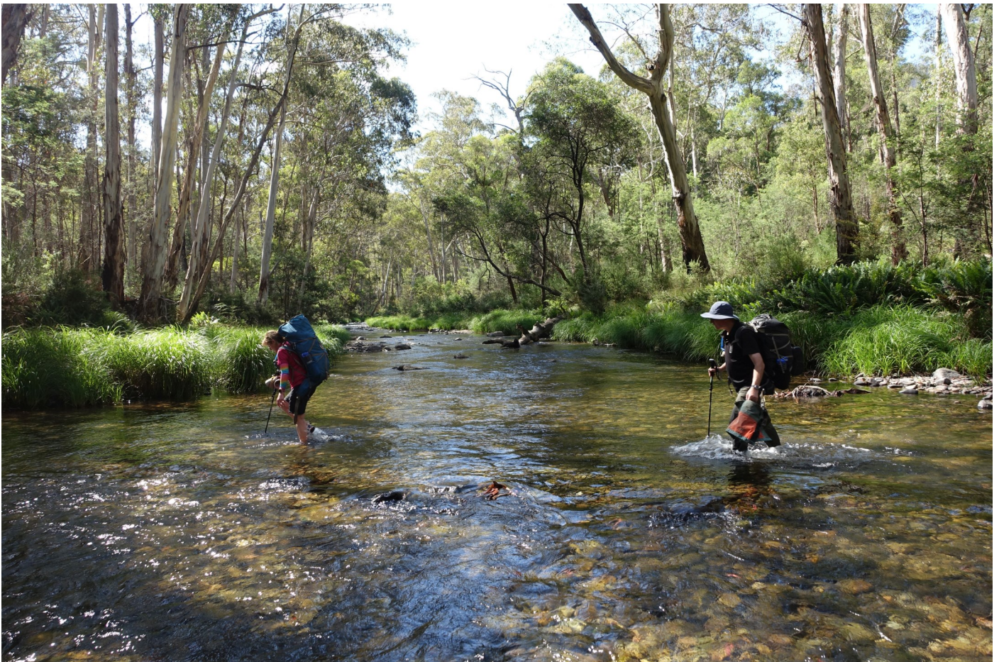
Fording the Dargo River

With the publication of the guidebook and the increasing popularity of long, multi-day walks (“thru-hiking”, as it is called in the United States and increasingly in Australia), the MMWT might in time attract an increasing number of walkers. But there was no sign of that when we did the walk. Although we encountered other people at some points – mostly 4WDers – we didn’t meet anyone else on the trail doing the MMWT. This was just as well at some of the campsites. Sometimes we were at spacious sites catering to the broader public, such as at Mayfield Flats on the Dargo River, Eaglevale on the Wonnangatta