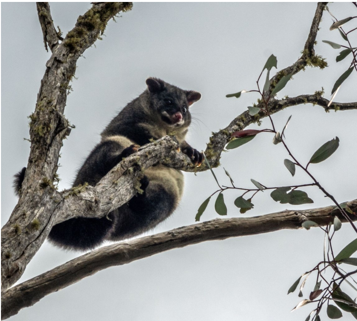
Mountain Brushtail Possum