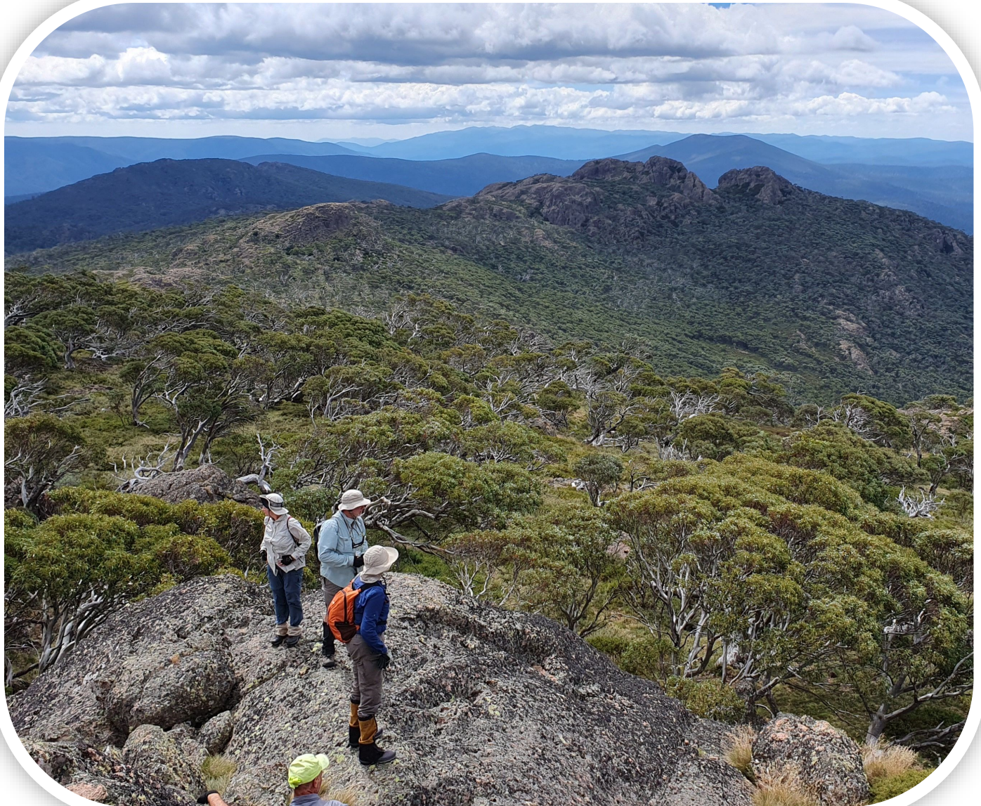
View from Cobberas No 1 Trig to Middle Peak, Cleft Peak and The Pilot

Canberra Bushwalking Club Inc GPO Box 160, Canberra ACT 2601 www.canberrabushwalkingclub.org