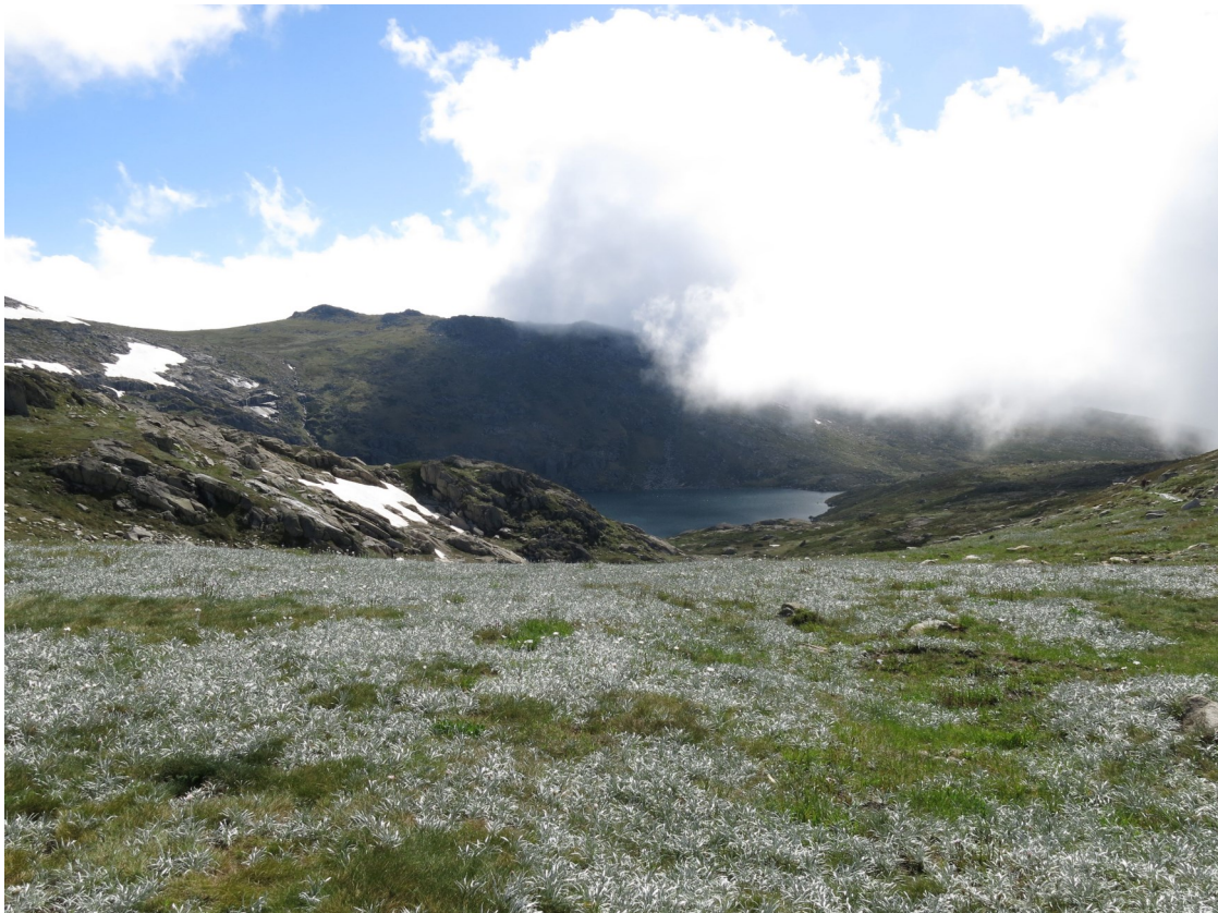
Painting and photo of Blue Lake by Ailsa Brown