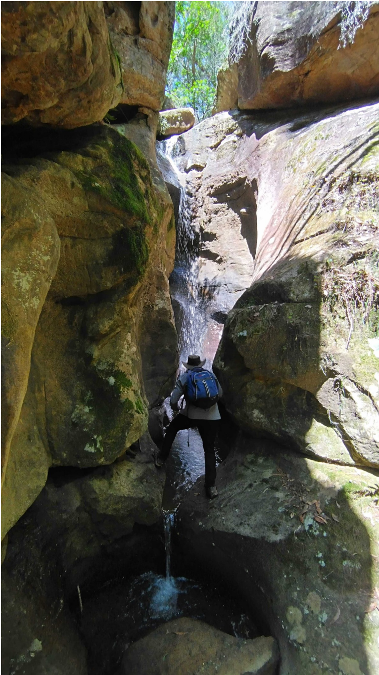
Joe at the trickling waterfall.

fall. At this stage we were walking quite high above the water which we could see about three to four metres below us. We continued along and spied a car tyre wedged between some tree branches about three metres higher than we were.