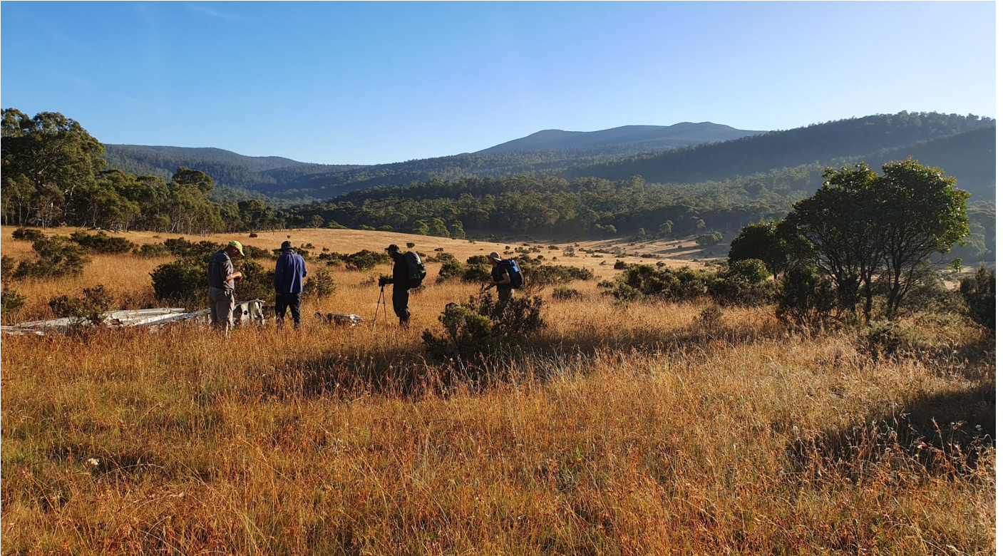
The plane wreck

we located all the features. On the final day, before departing Cowombat Flat, we paused to visit the remains of the wreckage of a crashed Air Force DC-3 (Aug 1954). The walk back to the trail head was a mundane trek along the Cowombat Flat Fire Trail, crossing multiple gullies and ridges.