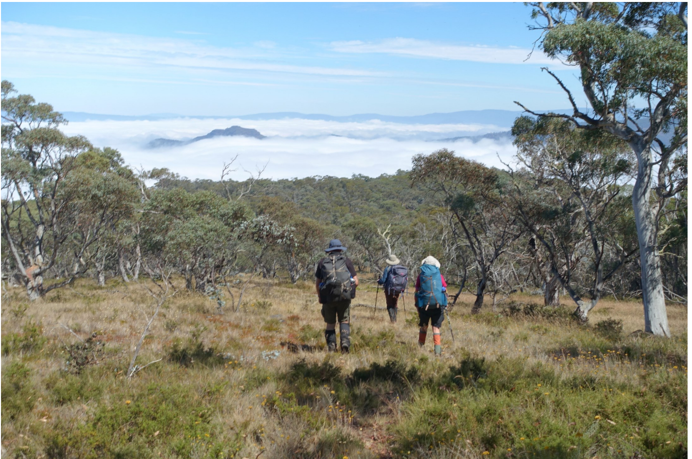
Towards the Crinoline from Little Tamboritha